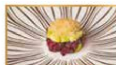
29. TARTARE SAKE KADAIFI (riso bianco, tartare salmone, avocado, kadaifi, ponzu)