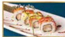
91. EBITEN SPECIALE 8PZ (gamberi* fritti, maionese, teriyaki, pesce misto scottato, spicymaio)