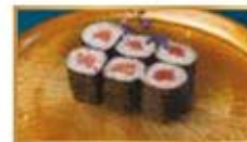
60. HOSOMAKI SALMONE 6PZ