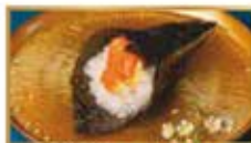
72. TEMAKI CALIFORNIA 1PZ (surimi di granchio*, avocado, maionese)