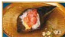
73. TEMAKI SPICY SALMON 1PZ (tartare salmone, spicymaio)