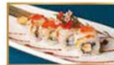
93. EBITEN SALMONE SCOTTATO 8PZ (gamberi* fritti, salmone scottato, granelle patate, teriyaki)