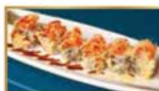
66. HOSOMAKI FRAGOLA 6PZ (fritto con salmone, philadelphia, fragola, teriyaki)