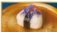
34. ONIGIRI TONNO COTTO 1PZ (tonno cotto, scaglie di pesce)