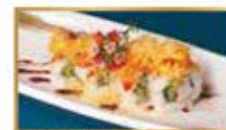
87. CALIFORNIA TOBICO 8PZ (surimi*, avocado, cetriolo, tobico, maionese)