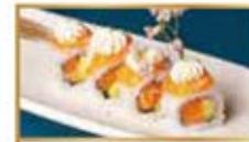
81. SAVOCADO EBITOBICO 8PZ (salmone, avocado, gambero* crudo, tobico)