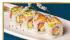
84. SAVOCADO MANGO 8PZ (salmone, avocado, mango, salsa mango)