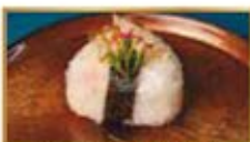
33. ONIGIRI MIURA 1PZ (salmone cotto, philadelphia, sesamo)