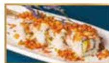
85. SAVOCADO RAINBOW 8PZ (salmone, avocado, pesce misto, sesamo)