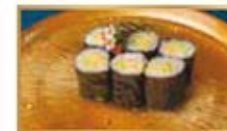
61. HOSOMAKI TONNO 6PZ