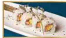
79. FUTOMAKI SAKE PHILA FRITTO 5PZ (salmone, philadelphia, teriyaki)