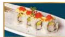
86. CALIFORNIA CIPOLLA 8PZ (surimi*, avocado, cetriolo, cipolla frita, teriyaki, maionese)