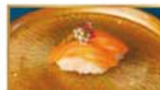
35. ONIGIRI SALMONE CRUDO 1PZ (tartare salmone, uova di pesce)