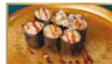
63. HOSOMAKI CETRIOLO 6PZ