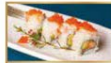
80. SAVOCADO ROLL 8PZ (salmone, avocado, sesamo)